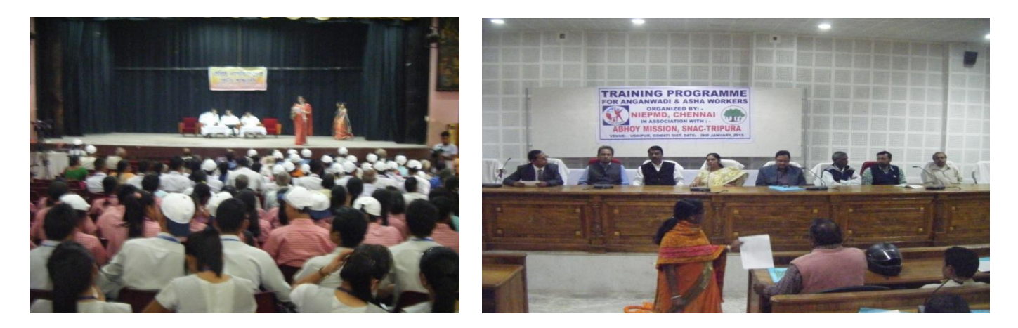
Awareness Camp with Anganwadi & Asha Workers by Abhoy Mission at Udaipur